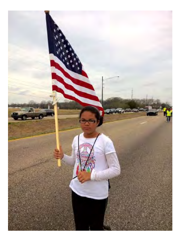
Leading the way! Twice she carried the flag all the way from Selma to Montgomery. The first time when she was 8!