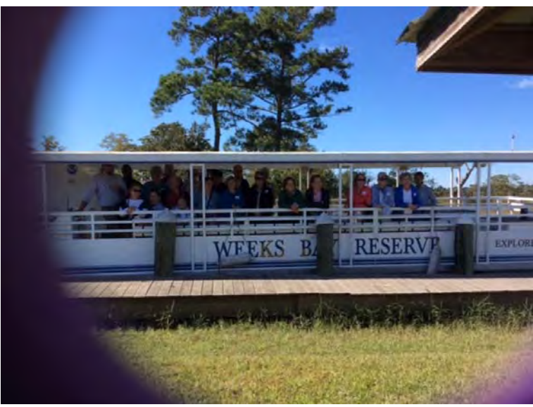
Tour of Weeks Bay