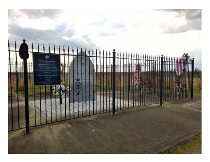
Remembering Viola Liuzzo