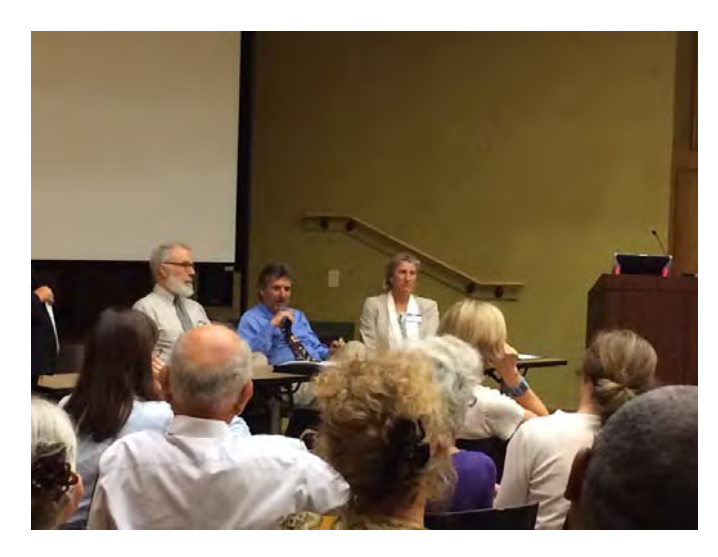
Symposium on Medicaid expansion

To be sure, the Baldwin League faces many challenges: lack of a single membership chair, loss of some new members who moved out of the state, difficulties with being a single league in a large county - the list is long. The lesson that Baldwin County can teach us is that we can never give up!!