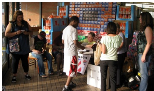
Voter Registration Drive - LWV East Alabama