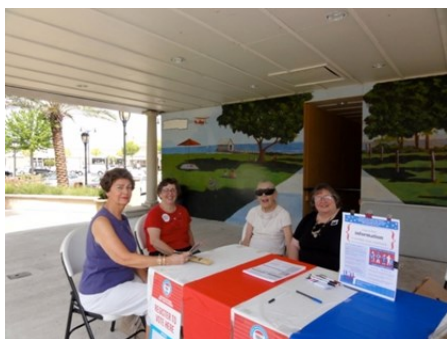
Voter Registration Drive - Baldwin Co.