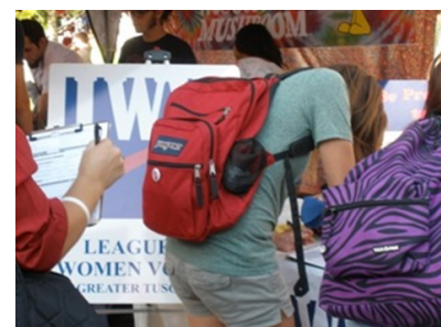
Voter Registration Drive - LWV Greater Tuscaloosa