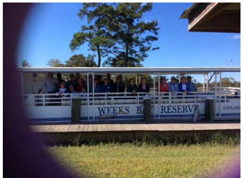
Tour of Weeks Bay