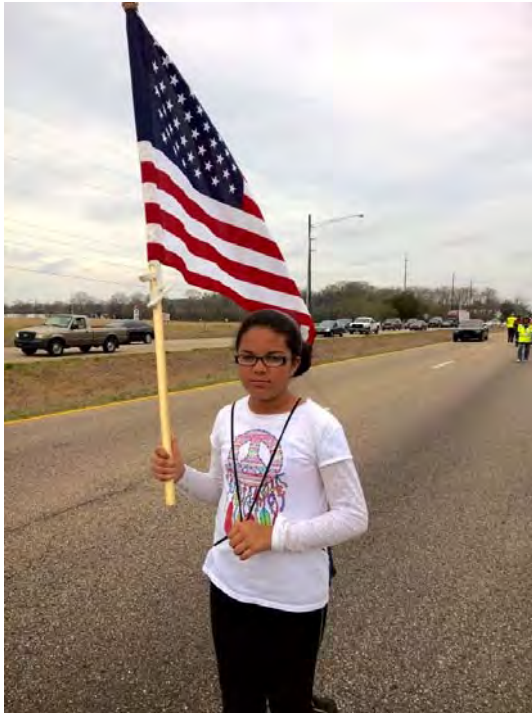
Leading the way! Twice she carried the flag all the way from Selma to Montgomery. The first time when she was 8!