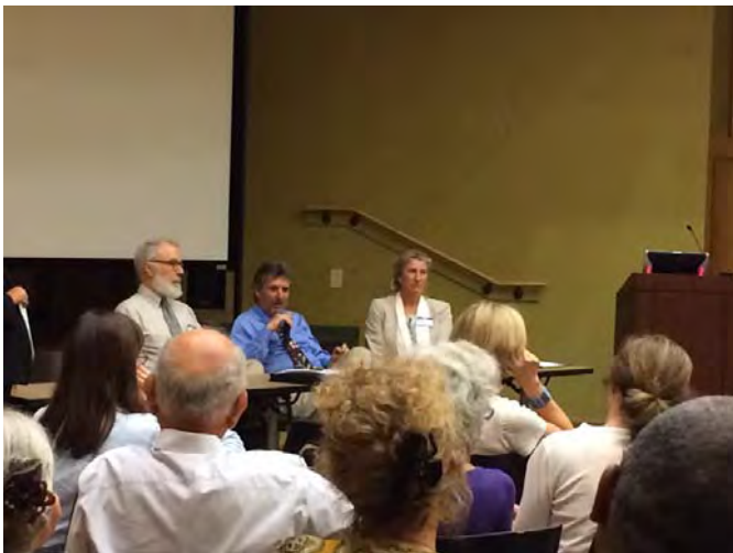
Symposium on Medicaid expansion

To be sure, the Baldwin League faces many challenges: lack of a single membership chair, loss of some new members who moved out of the state, difficulties with being a single league in a large county - the list is long. The lesson that Baldwin County can teach us is that we can never give up!!