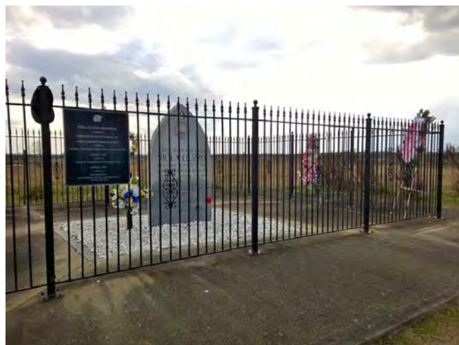
Remembering Viola Liuzzo