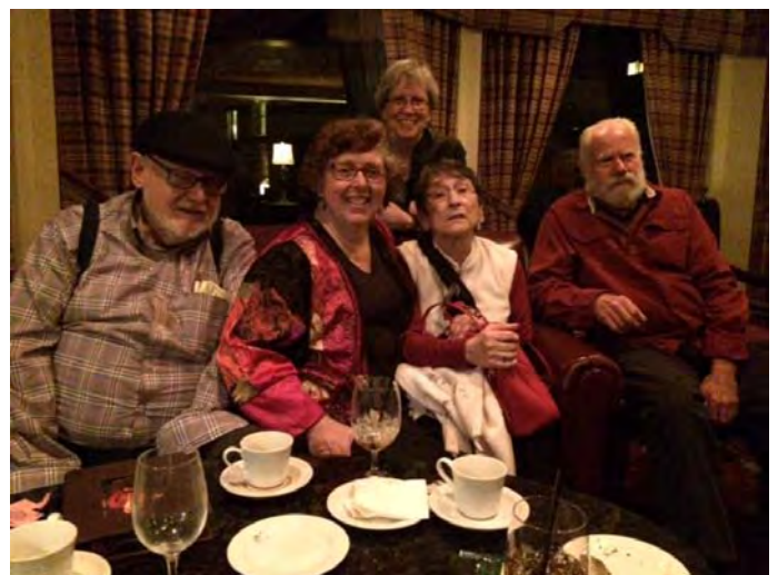
Mobile members enjoy the sunset at the Grand Hotel

The full report can be found at www.supportthevoter.gov .